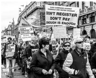
non-registration is key to the Household Tax resistance campaign

[T]he councils still had one insurmountable headache. They had to find out where people worked. This was a real nightmare because other than asking the people concerned, they had no real way of getting the information they needed. When a liability order was granted by the court, non-payers were sent a form which requested details of employment. Failure to fill it out carried a fine of £100 and £400 if the non-payer provided false information. But this didn't act as a deterrent either, because, if people couldn't pay the Poll Tax itself (and the court costs which were added), then it made little difference if the council added another £100. A survey carried out by the Audit Commission in late 1989 showed that, nationally, only 15% of people who received the form actually sent it back. Like electoral registration, it was widely ignored even though this was a criminal offence. 159