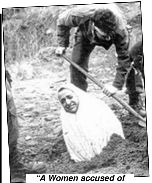
"A Women accused of Adultery is about to be stoned"

from 'HOPI' (Hands off the People of Iran)